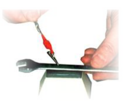
Deep etch marking