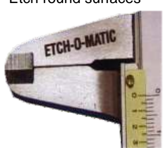
Black mark in 3 seconds