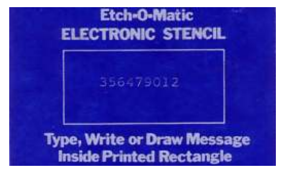
The special stencils 55mm x 75mm can be used for 50 - 100 marks if handled carefully.