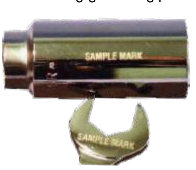
Deep etch in 15 seconds